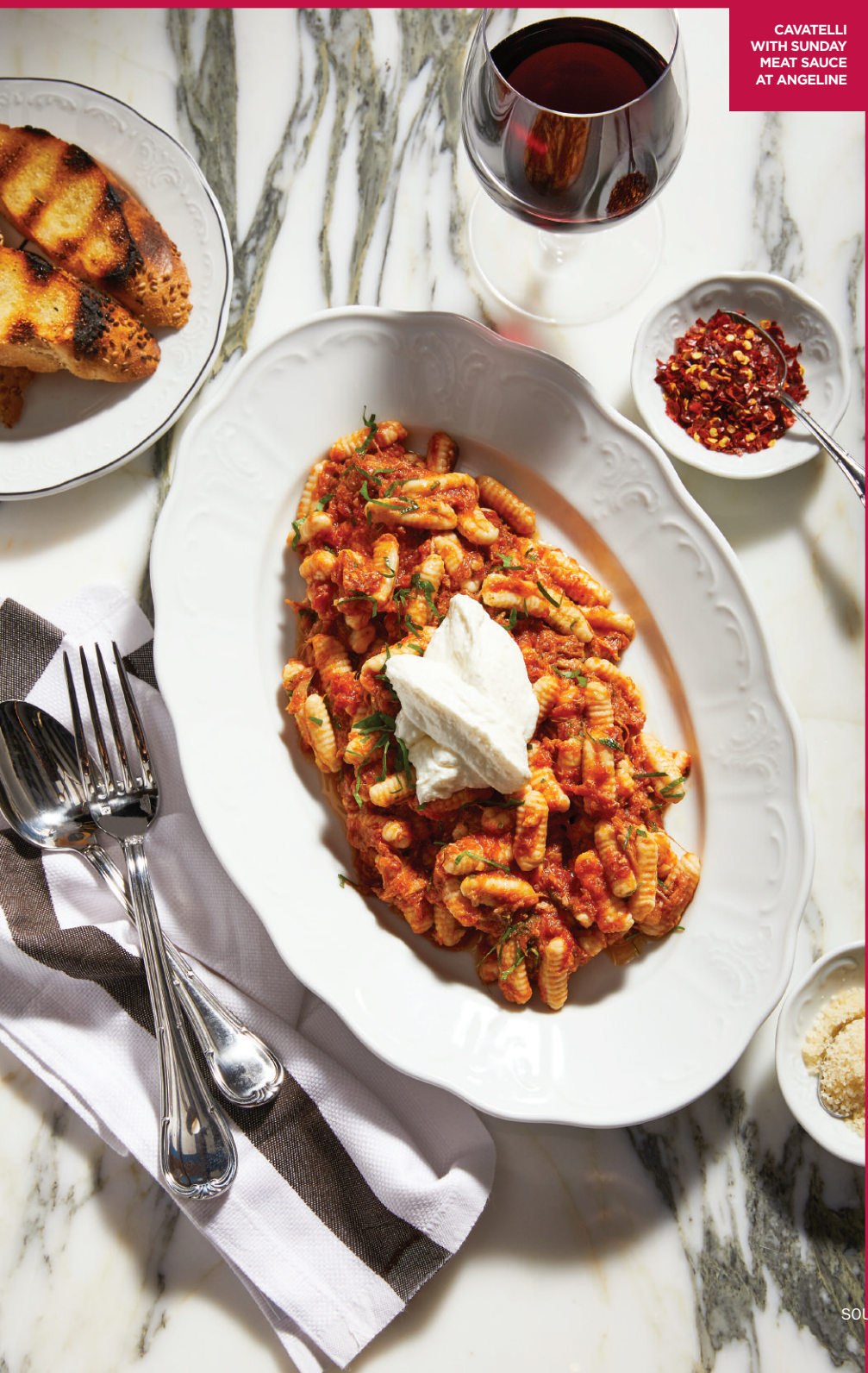
CAVATELLI WITH SUNDAY MEAT SAUCE AT ANGELINE

ATLANTIC CITY HAS LONG BEEN A DESTINATION for gambling, entertainment and, of course, fine dining. But in recent times, the city has renewed its stake as a food destination, thanks to a collection of new restaurants and familiar favorites—not to mention plenty of culinary star power—that are helping change the way folks think about casino dining. Sure, there are still the buffets and the walk-up noodle bars, but more and more the dining scene in A.C. is taking new shape and cementing itself as one of the country's great food towns with modern spaces and inventive dishes. We ate our way from the Boardwalk to the marina and chose the meals (and a few drinks) that we feel showcase the best the city has to offer and found our luck is much better at these tables.