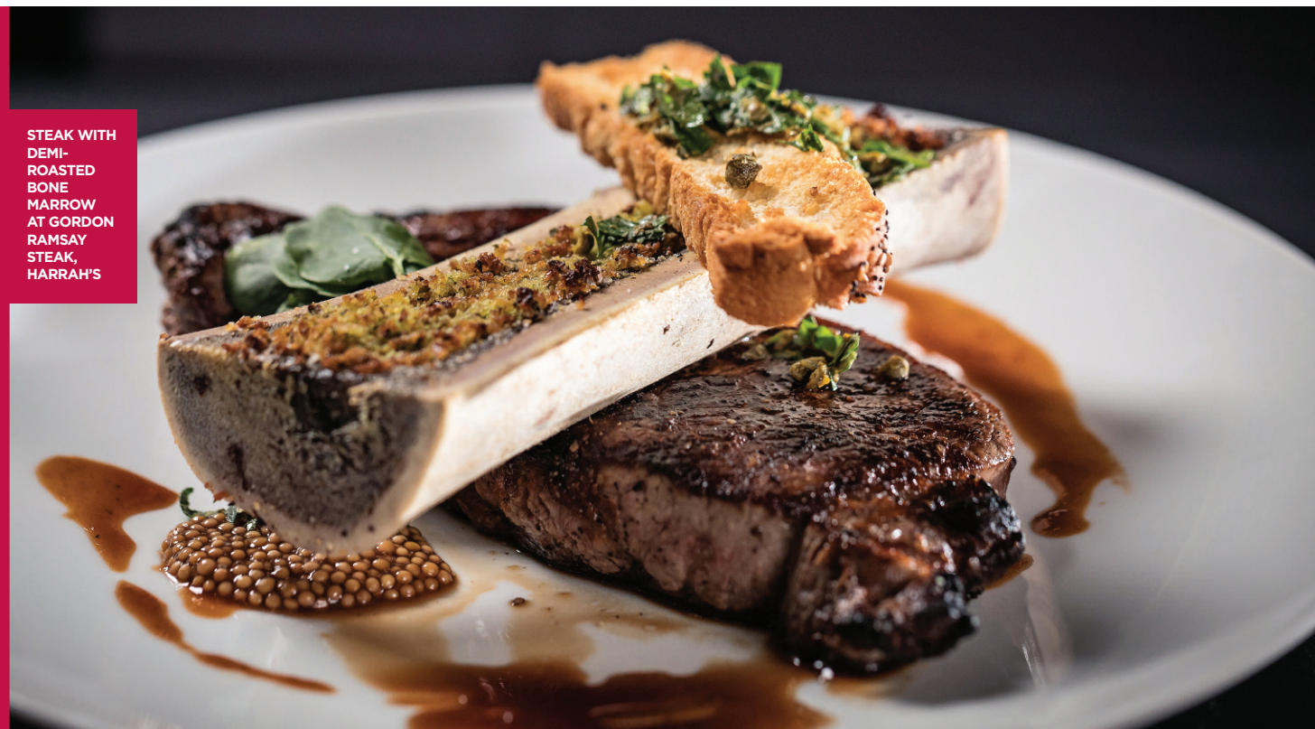
STEAK WITH DEMI- ROASTED BONE MALLOW AT GORDON RAMSAY STEAK, HARRAH'S