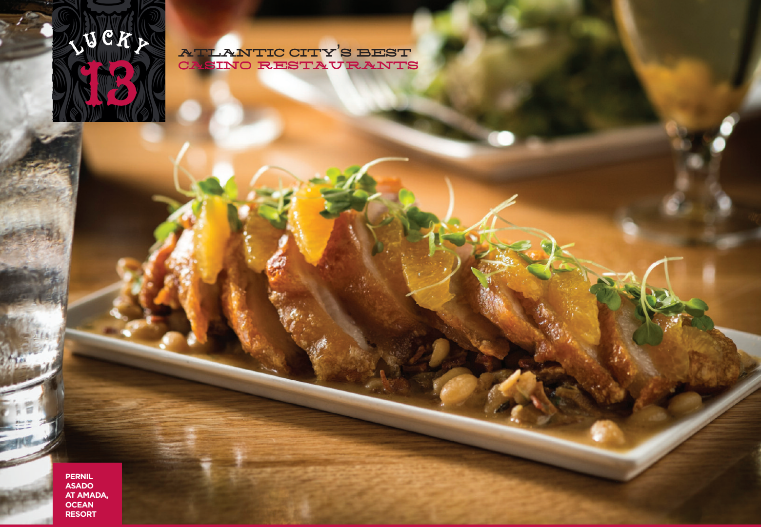
PERNIL ASADO AT AMADA, OCEAN RESORT

WHAT YOU'LL ORDER: After starting with the shaved fennel salad that is finished with a touch of mint and dressed with a lemon vinaigrette, go for something a little heartier and order the cavatelli with a “Sunday” meat sauce and a large dollop of ricotta.