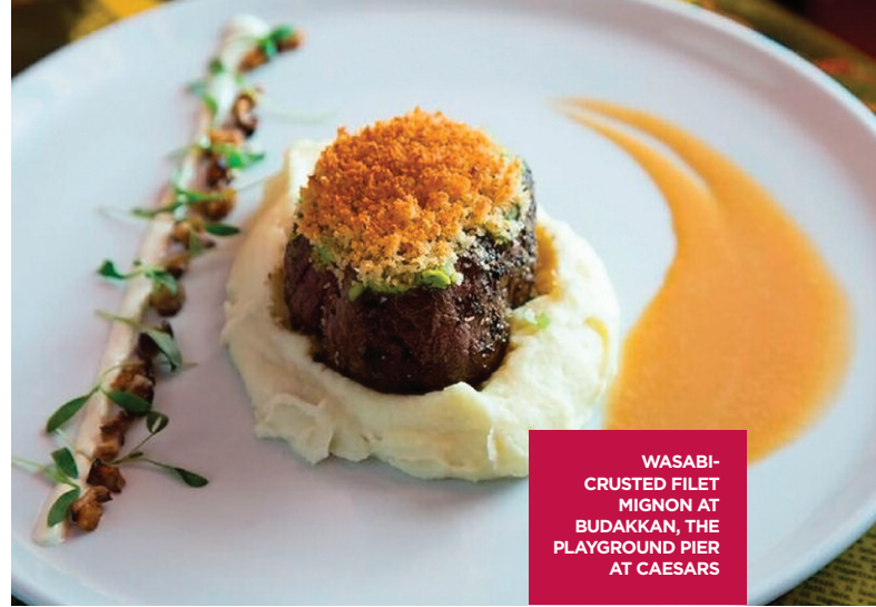
WASABI-CRUSTED FILET MIGNON AT BUDAKKAN, THE PLAYGROUND PIER AT CAESARS

A trip to Olón is a like a journey through chef Jose Garces' childhood, where he combines his memories of eating ceviche on the beach