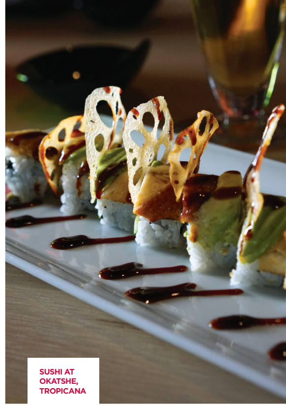
SUSHI AT OKATSHE, TROPICANA

EXTRA BITE: Izakaya offers a special menu on Mondays that features several food items ranging between $7 and $14 along with specials on cocktails and carafes of sake .