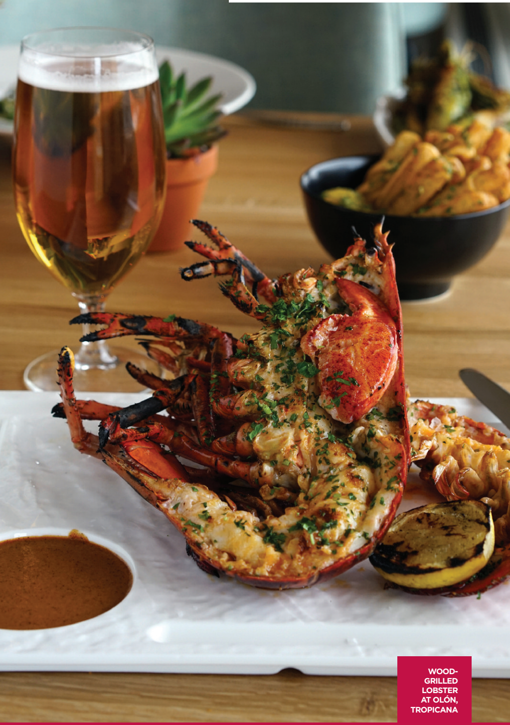
WOOD- GRILLED LOBSTER AT OLÓN, TROPICANA

$6 wines by the glass and other assorted drink specials.