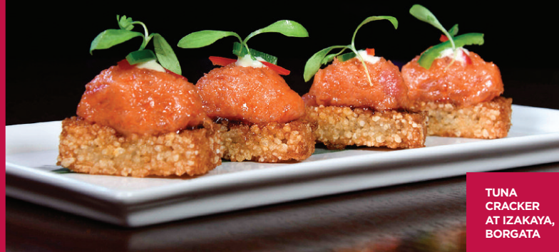
TUNA CRACKER AT IZAKAYA, BORGATA